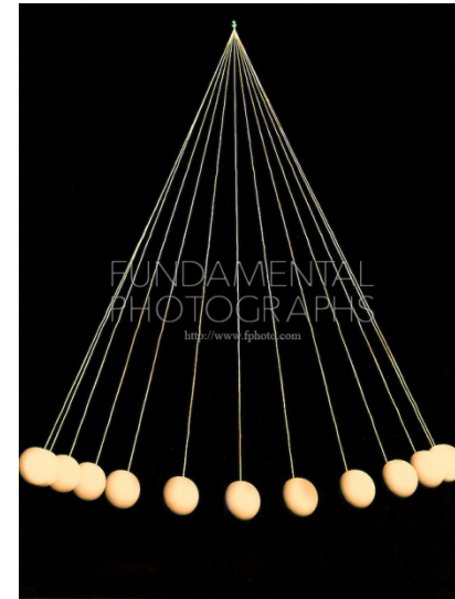
Classical harmonic Oscillator probability P(x)